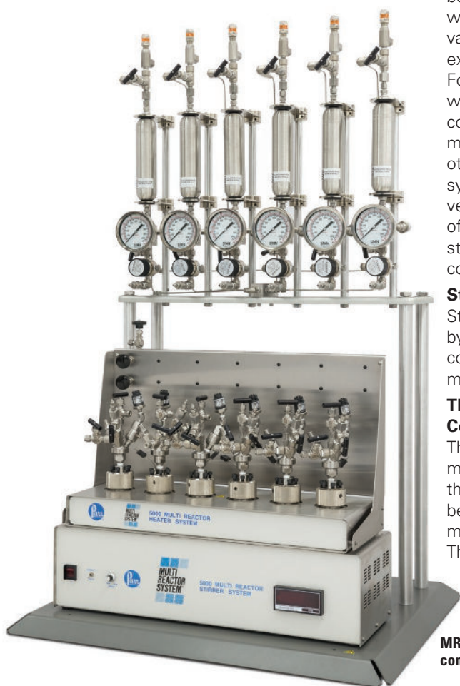
MRS with individually controlled Gas Burettes.

The controller provides Ramp & Soak programming for individual reaction vessels, digital inputs and outputs for interlocks, alarms or other safety features, and additional analog and digital inputs and outputs to control flow meters or other accessories which might be added at some future date. The user's control station is a PC running any current Windows operating system. A simplified graphical user interface has been designed for the control and monitoring of the Series 5000 Multiple Reaction System. The PC is used strictly as the user interface and data logging module. All control actions are generated in the 4871 Process Controller (not the PC).