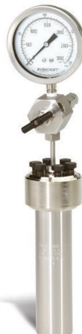
Model 4750-200mL-A Vessel, with 4310 Gage Block Assembly.