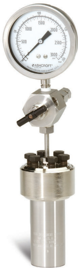
Model 4750-125mL-A Vessel, with 4310 Gage Block Assembly.