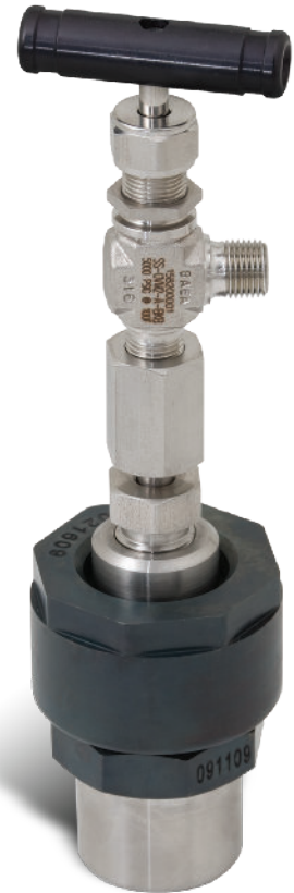
Model 4700-22mL-A Vessel shown with needle valve.

These heads can also be furnished with 1/8" NPT, 1/4" NPT, or a rupture disc assembly. These vessels are normally heated in ovens, baths, or similar general purpose heating devices. Special heaters for these vessels are not available from Parr.