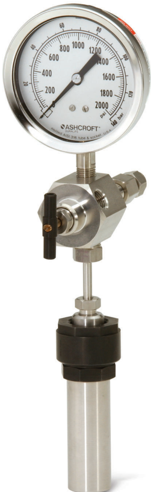
Model 4700-45mL-A Vessel, with 4310 Gage Block Assembly.

An example order number for a vessel this series is: