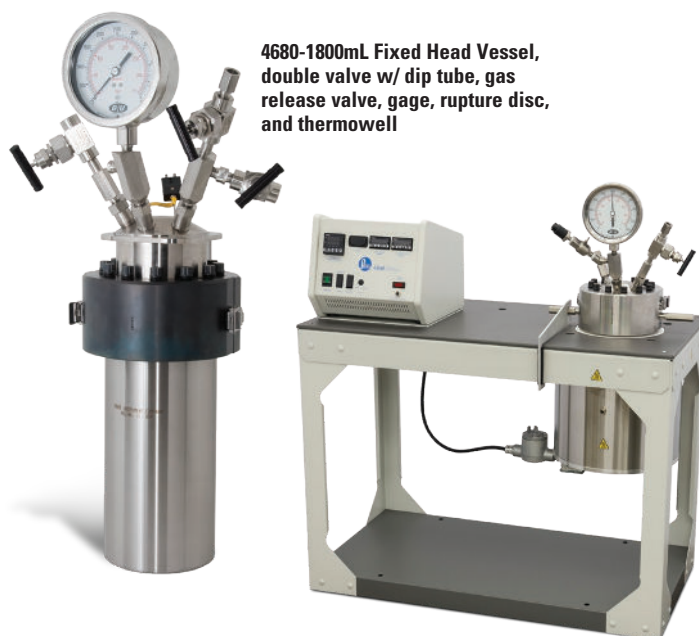
4680-1800mL Fixed Head Vessel, double valve w/ dip tube, gas release valve, gage, rupture disc, and thermowell