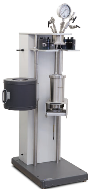
4680-1800mL Fixed Head Vessel shown with Split Rings open and vessel down using a pneumatic lift.

Standard Maximum Operating Temperature, °C: 600 w/ Flat FG Gasket